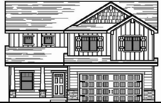
1822 - ELEVATION C