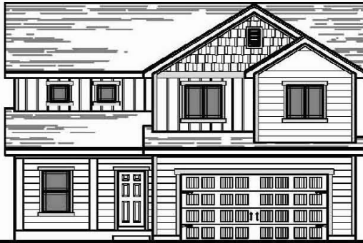
1822 - ELEVATION A