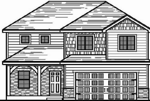
1822 - ELEVATION B