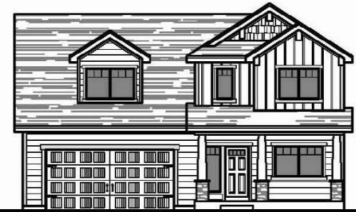
1966 - ELEVATION C