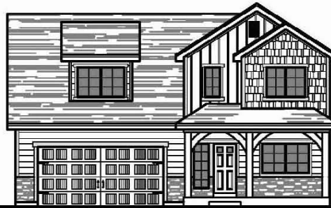
1966 - ELEVATION B