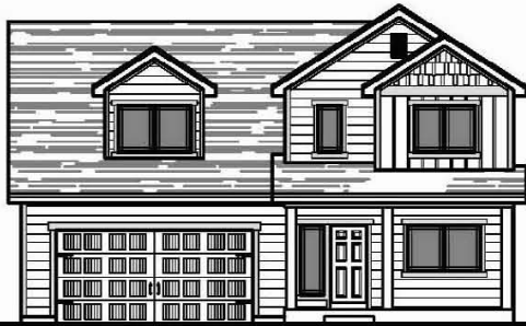
1966 - ELEVATION A