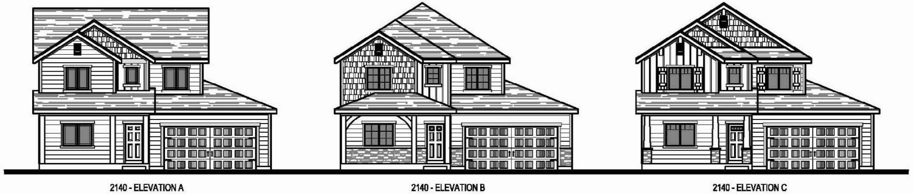
2140 - ELEVATION A